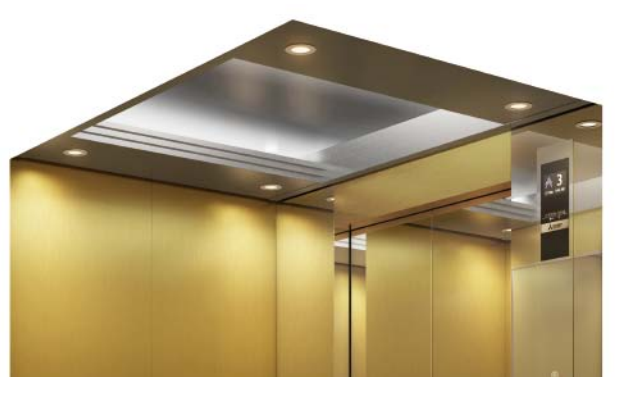
N300S Ceiling: SUS-HL Others: Same as N300