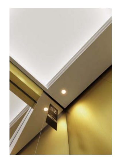
Ceiling: Painted steel sheet (Y033) Lighting: Central indirect lighting and downlights