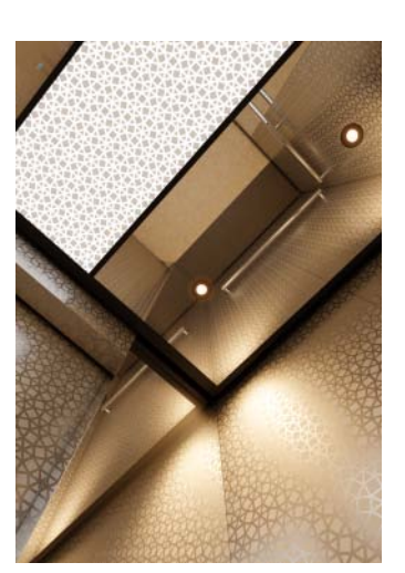
Ceiling: [Center] Milky white resin panel [Sides] Resin panels with mirrored surface Lighting: Central lighting and downlights