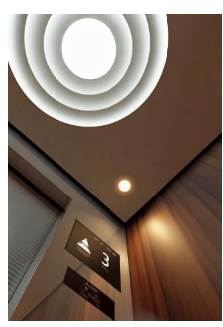
Ceiling: Painted steel sheet (Y033) Lighting: Central indirect lighting and downlights