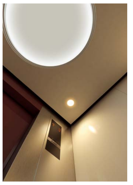
Ceiling: Painted steel sheet (Y033) Lighting: Central indirect lighting and downlights